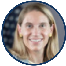
CAROLINE CRENSHAW 1 COMMISSIONER UNITED STATES SECURITIES AND EXCHANGE COMMISSION (SEC)

Whether in the news, social media, popular entertainment, and increasingly in people’s portfolios, crypto is now part of the vernacular. 2 But what that term actually encompasses is broad and amorphous and includes everything from tokens, to non-fungible tokens, to Dexes to Decentralized Finance or DeFi. For those readers not already familiar with DeFi, unsurprisingly, definitions also vary. In general, though, it is an effort to replicate functions of our traditional finance systems through the use of blockchain-based smart contracts that are composable, interoperable, and open source. 3 Much of DeFi activity